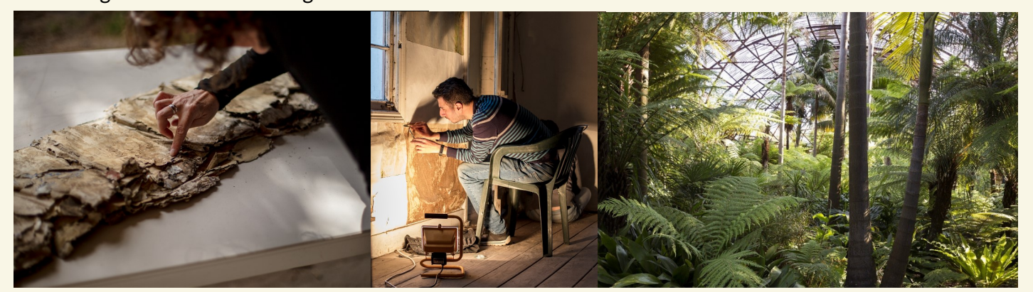
Images: The loss of traditional skills and threat of climate change are urgent threats to Australia's heritage

The decline and disappearance of traditional heritage trade skills presents a significant threat to our continued ability to conserve and restore historic sites. The use of traditional trades is essential for achieving high quality conservation of culturally significant places in accordance with the Australia ICOMOS Burra Charter . A systematic program of training which links existing practitioners with willing participants in delivering detailed skills training is needed.