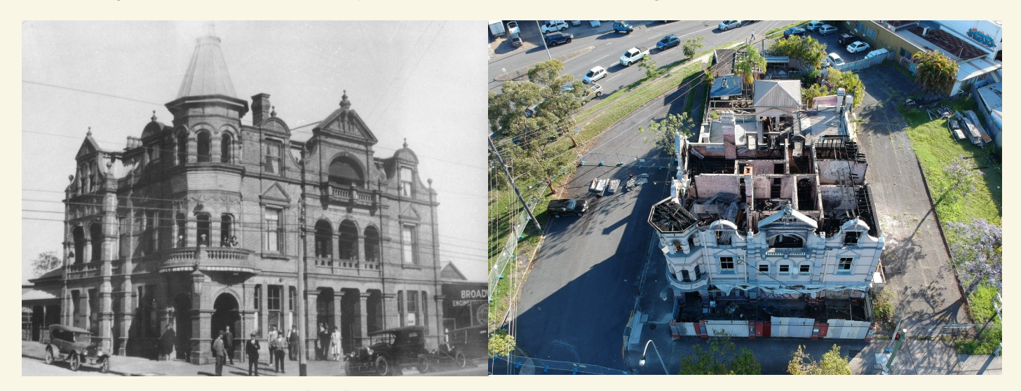
Broadway Hotel, Woolloongabba (QLD). Damage from consecutive fires and internal flooding has placed this building at risk of demolition by neglect and highlighted weaknesses in State legislation.

Identifying and protecting heritage places is fundamental to ensuring that they are appropriately conserved, celebrated and passed on to future generations, however our lists must evolve and adapt as our understanding of what heritage is evolves and adapts. The development of the National Heritage List into a list that is truly representative of Australia's most outstanding heritage places has suffered from underresourcing and is not reflect a true representation of Australia's heritage.