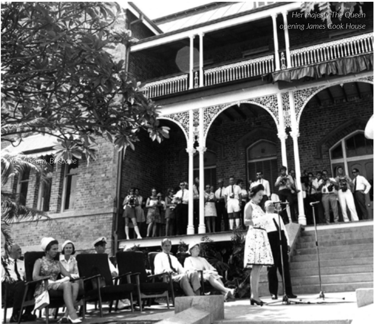
Her majesty The Queen opening James Cook House