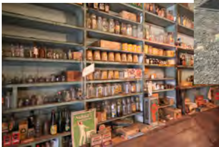
Shelf view shows the volume of contents on the shelves with items removed for digital photography.

We continue to support Maryborough Open House which gains wide-spread publicity. The event is a free event for visitors but is a great deal of work for those who open their properties. Brennan & Geraghty's Store Museum gets a lot of visitors at these events which can be challenging to manage. We have to take into consideration the visiting public and the safety of the collection. The event does draw in a number of visitors to the Region which helps us with any promotional work that we do.