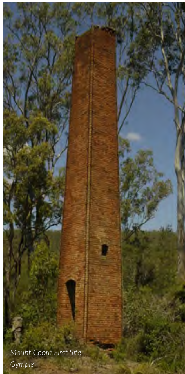
Mount Coora First Site Gympie

We have been very active as individuals in several policy-setting areas of Gympie Regional Council. Our meetings continue to be a valuable source of inspiration and collective knowledge sharing that support these activities. Heritage is being well promoted in this region as a consequence.