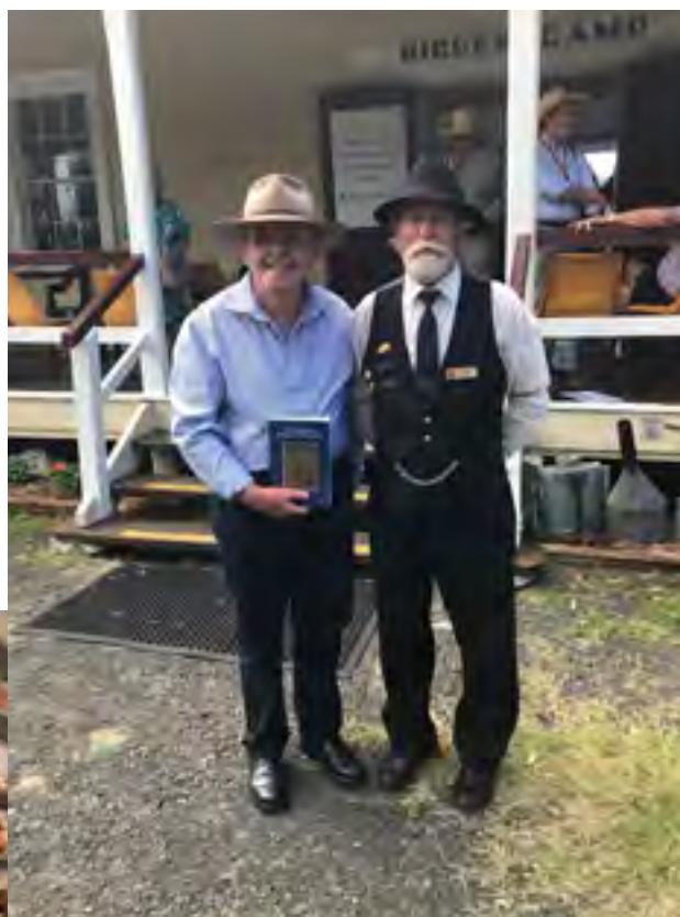
Forgotten Men of Grandchester Book launch at Grandchester Railway