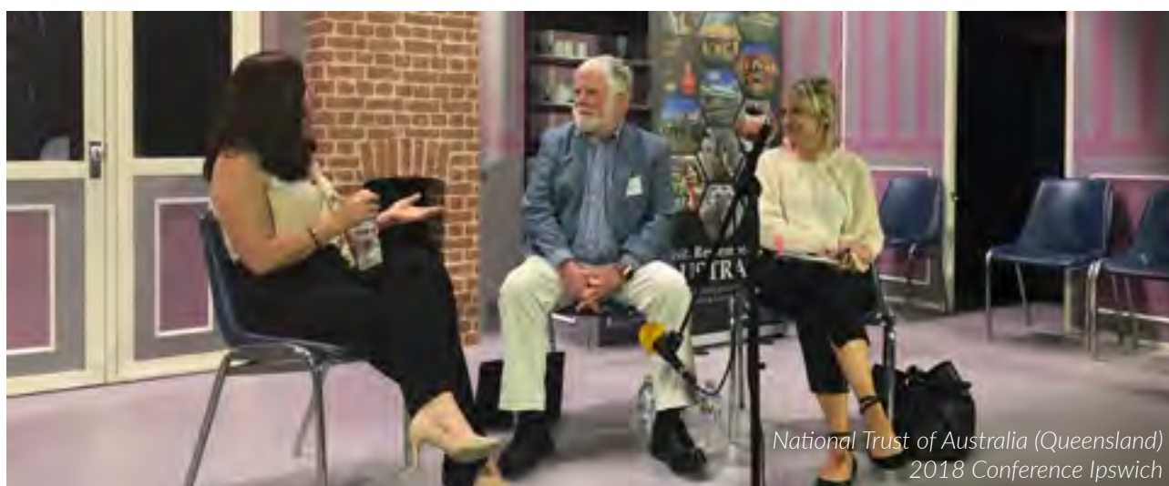
National Trust of Australia (Queensland) 2018 Conference Ipswich