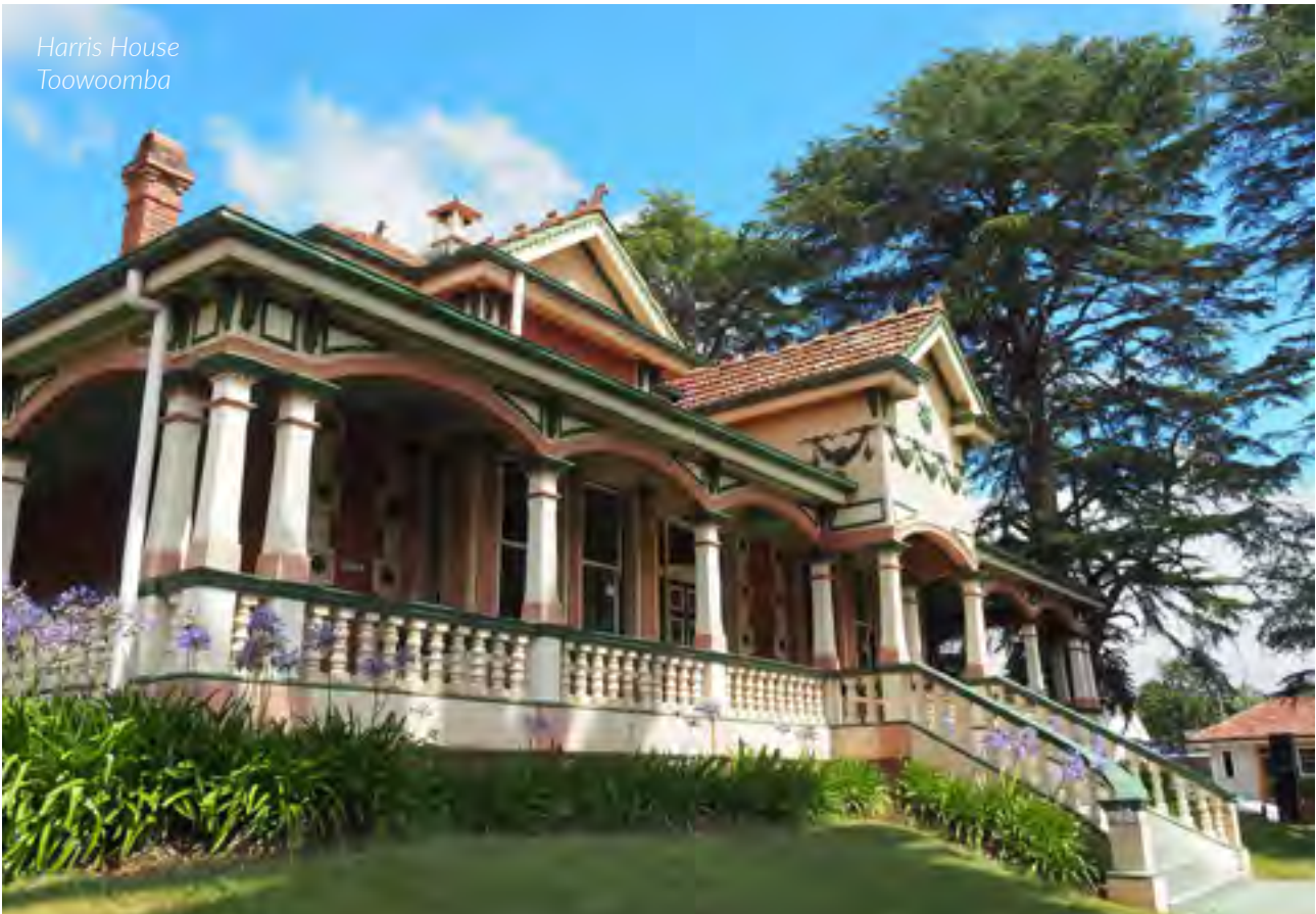
Harris House Toowoomba