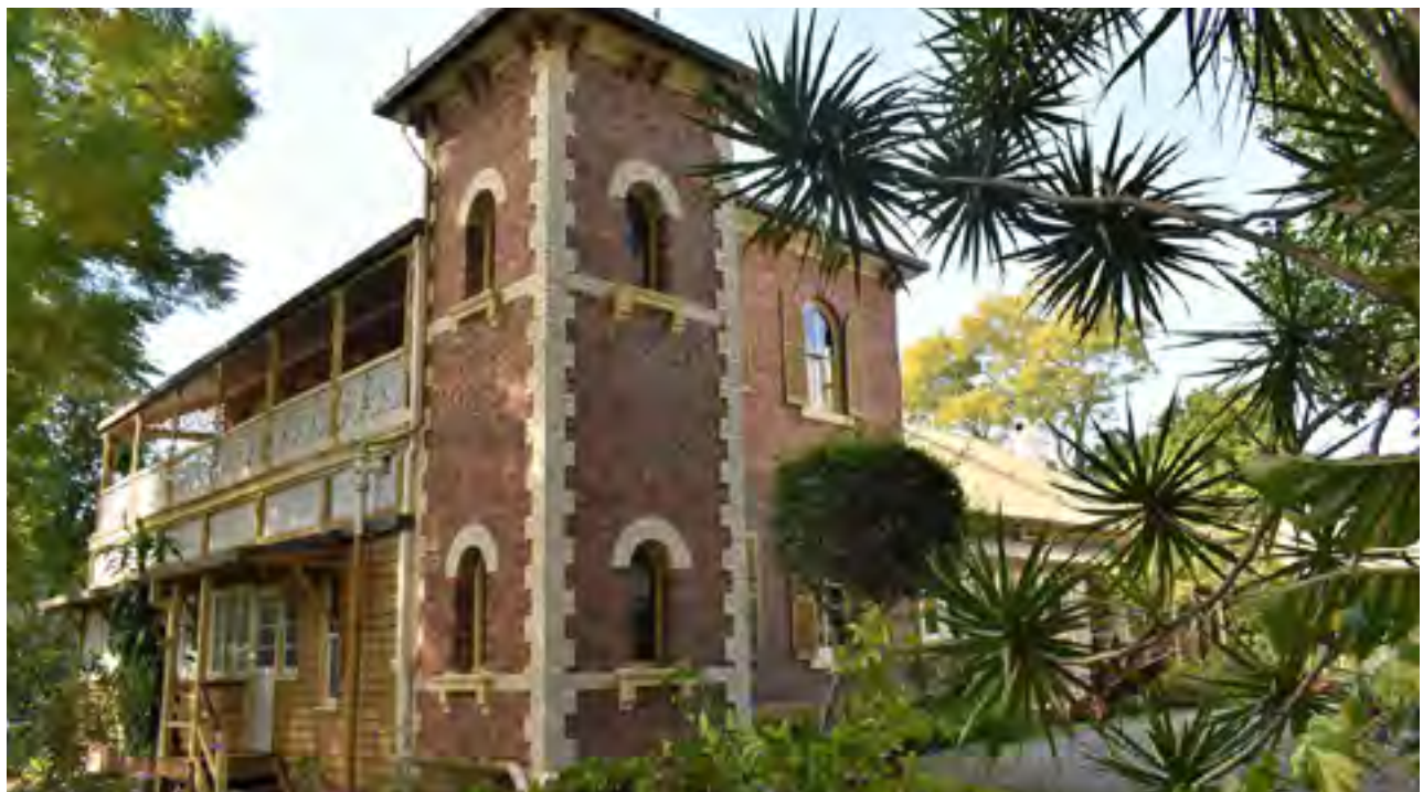
TOP LEFT: CLAREMONT